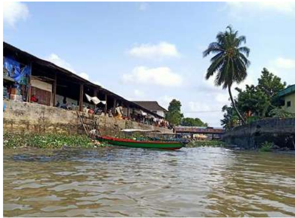
Fig.2. Sampling Point at Creek (Sampling 2)