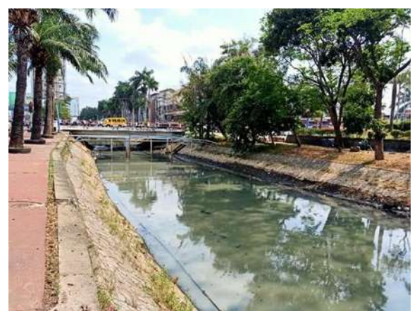
Fig. 1. Sampling points at Radial Street (Sampling 1)

The water quality research was carried out at two monitoring points by dividing into two segments, determining monitoring points as river water sampling points using a purposive sampling method based on case of access, cost and time in this study. The initial assumption in this study will be use 2 sampling points at the Radial Street (Fig.1) and creek points of the Sekanak River (Fig.2).