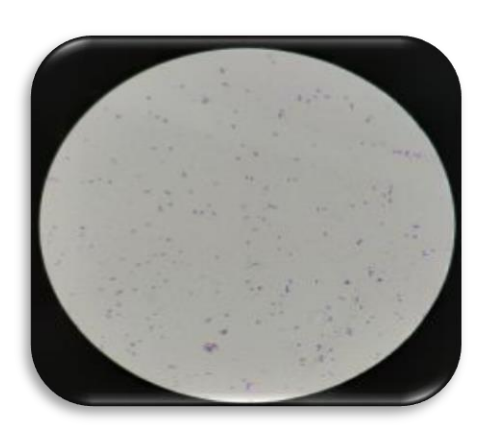
Figure 2. Morphology of Gram-positive Streptococcus pneumoniae lancet lancet