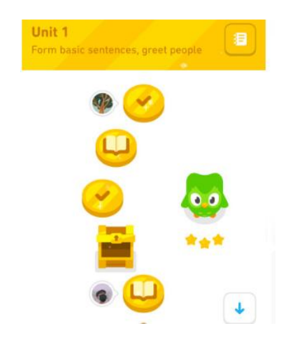
Figure 2.2 List of Topics

Figure 2.1 presents the data of some courses provided by Duolingo both for Indonesian speakers and English speakers.