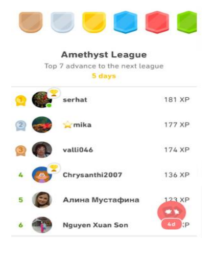
Figure 2.6 Leader Board/ League

Figure 2.5 demonstrates how many stories with various topics Duolingo offers. The stories feature dialogue and conversations in addition to narrations that are focused on everyday communication. The stories' subjects include greetings, families, cuisine, education, and vacations, among others.